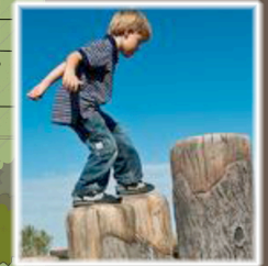
Fitness and Agility Zone